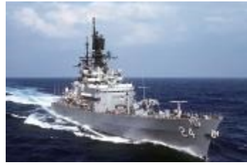
1985—Yokosuka from Australia