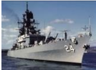
1975—Departing Pearl Harbor