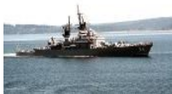
1992—Seattle Sea Fair Festival