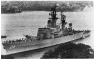
1968— Entering Sydney Harbor